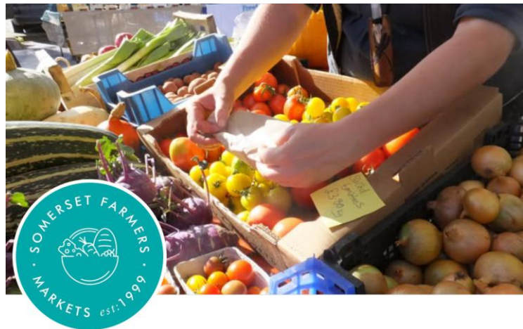
Somerset Farmers Markets